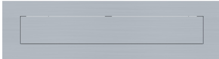
PLATE 300 / 400